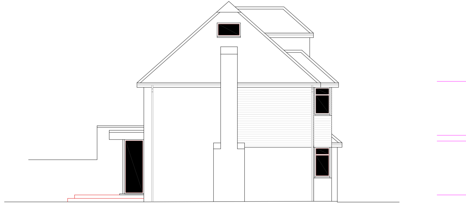
PROPOSED SIDE ELEVATION 1:100 @ A3 - REAR EXTENSION OMITTED FOR CLARITY

FACING BRICKWORK TO MATCH EXISTING GREY POWDER COATED ALUMINIUM WINDOWS AND DOORS WINDOW TO FRONT ELEVATION TO MATCH FRONT ELEVATION WINDOWS PARTIAL TIMBER CLADDING TO FRONT ELEVATION TO MATCH EXISTING GREY POWDER COATED ALUMINIUM SOFFITS AND FASCIAS TO MATCH WINDOWS AND DOORS GREY POWDER COATED ALUMINIUM RAINWATER GUTTERS TO MATCH WINDOWS AND DOORS FLAT PANEL ROOF WINDOWS SEDUM ROOF TO BOTH EXTENSIONS